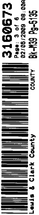
EXHIBIT "A" SKY VIEW RID