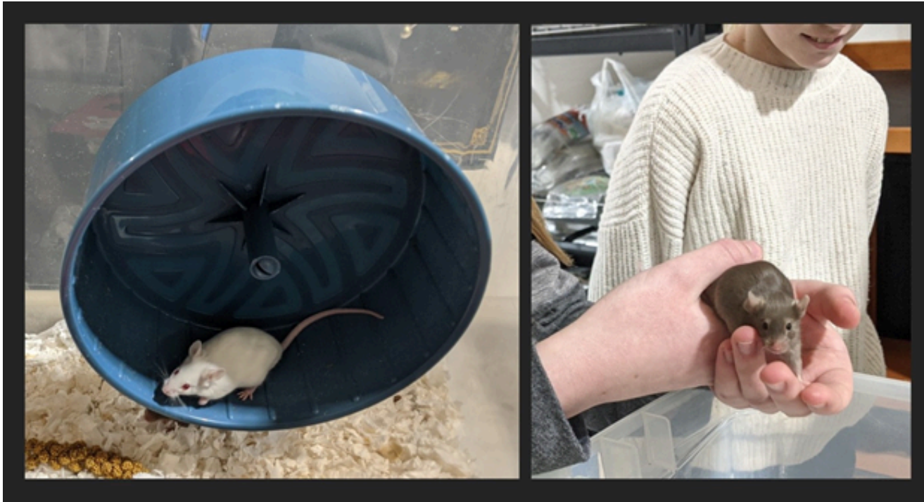
Pet Mice