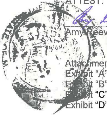
Exhibit "A" Exhibit "B" Exhibit "C" Exhibit "D"