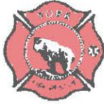
EXHIBIT "C" TO RESOLUTION 2019-41: Petition for Annexation of Properties into York Fire Service Area