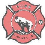
EXHIBIT "C" TO RESOLUTION 2019-26: Petition for Proposed Annexation of Properties into York Fire Service Area